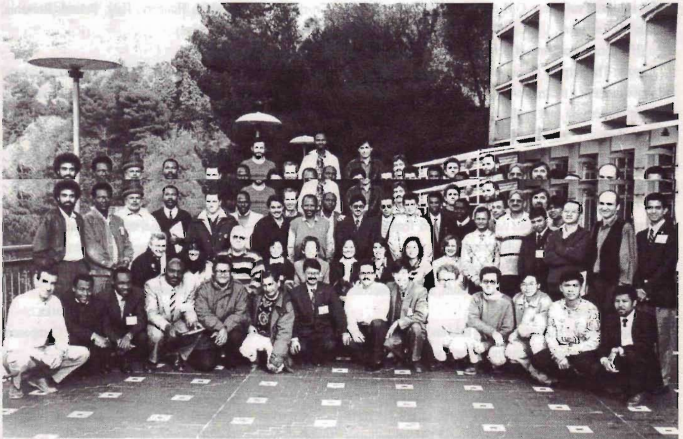
ICTP-UNU-Microprocessor Laboratory: Third Course on Basic VLSI Techniques, 21 November – 16 December 1994.

have a real impact if cost problems were not correctly addressed. Consequently, when organizing the Course, we decided to choose IBM PC clones as our workstations, and public domain software for our operating system and specific CAD tools. Fortunately, Linux is a good Unix-like public domain operating system that allowed us to use Alliance, a set of integrated tools with all the required characteristics for the course. Alliance was created at the Pierre and Marie Curie University of Paris, France, where it is used for a course that runs for a full year. Since no documentation was available to teach Alliance, the Microprocessor Laboratory staff had to work for several months, preparing lectures and laboratory exercises, in order to teach in just one month what is usually taught in a much longer period. The result of this effort was the present Course, whose excellence, value and success may be better judged by the comments of the participating scientists, and by the fact that already two universities, one from Switzerland and one from Malaysia, are interested in using our format. As an isolated example, we can mention that participating physicists with no previous knowledge in chip design are now capable of designing, as a project, a commercially available IC such as the Motorola PIA. Given the advanced characteristics of the Course, the staff was very small, and their work hours very long, since the Laboratory was open