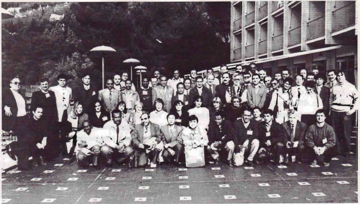
Second Workshop on three-dimensional modelling of seismic waves generation, propagation and their inversion, 7 – 18 November 1994.