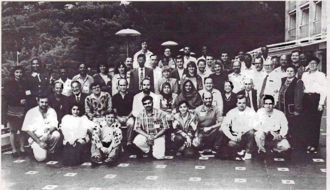
College in biophysics: experimental and theoretical aspects of biomolecules, 26 September – 14 October 1994.

Biophysics College, as it occurred this year. In this manner a valuable sector of the participants may maximize the benefit of their visit to this Centre.