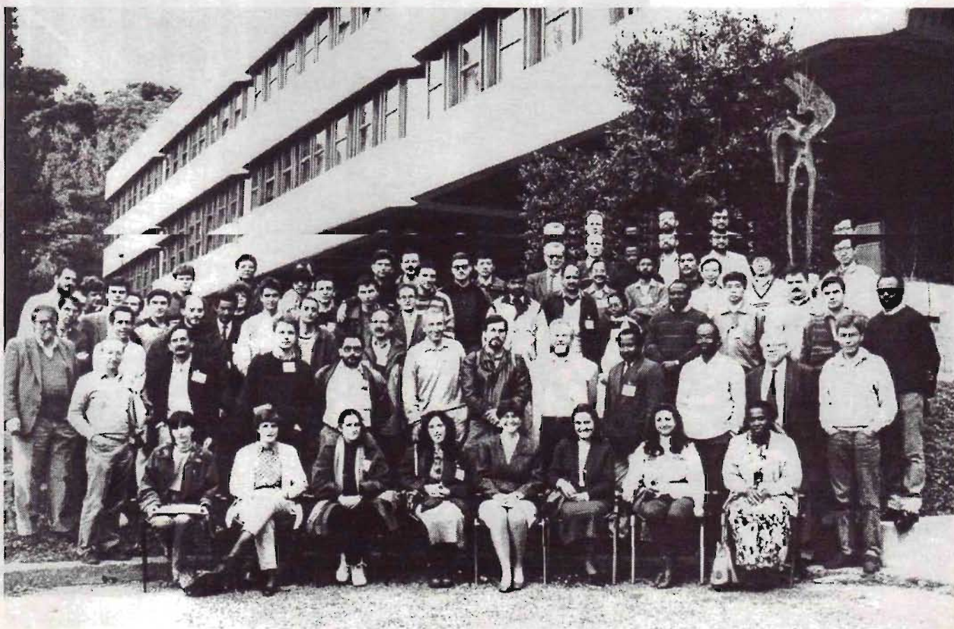
Workshop on variational and local methods in the study of Hamiltonian systems (Euroconference), 10 – 28 October 1994.

The Workshop was a successful attempt to bring together leading experts in those aspects of Hamiltonian mechanics which are more directly related to the N-body problem in celestial mechanics, both from the "local" point of view (relative equilibria, periodic orbits and their stability, K.A.M. theory