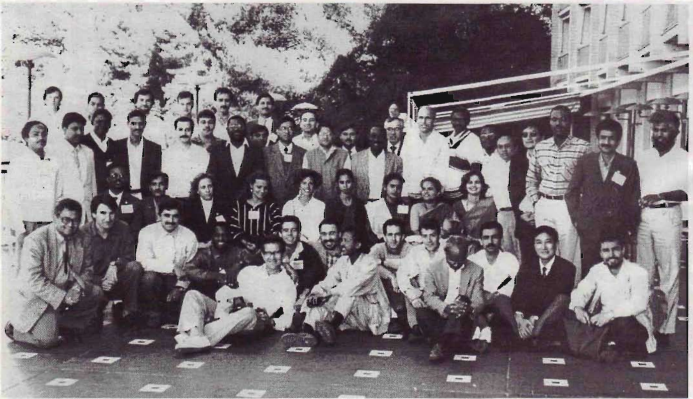
Third College on microprocessor-based real-time control — Principles and applications in physics, 26 September – 21 October 1994.

a circuit board external to the PC in the third week and work on half a dozen projects during the last.