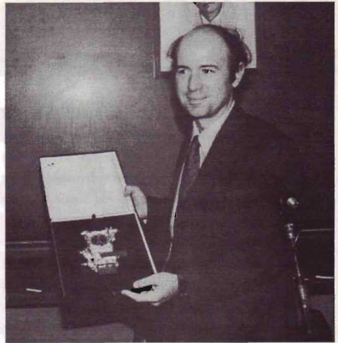
Prof. F. Wilczek was awarded the Dirac Medal of the ICTP 1994 during the Conference on Recent Developments in the Phenomenology of Particle Physics (3-7 October 1994). The title of his lecture was "Two kinds of asymptotic freedom".