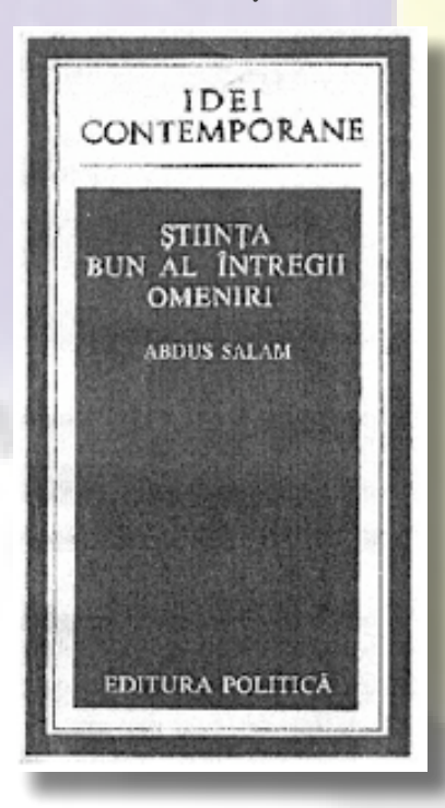
Fig. 3. Romanian Translation of Abdus Salam's "Ideals and Realities"