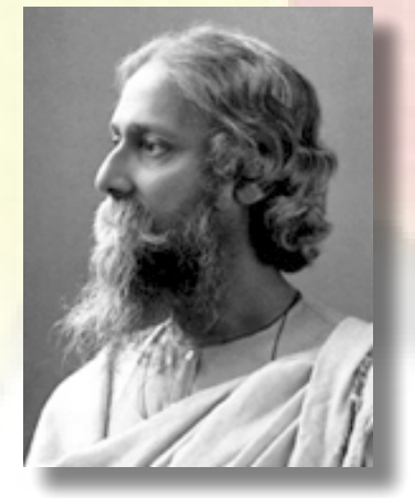
Fig.1. Rabindranath Tagore (1861–1941)

When I subsequently settled down in the US, I came in contact with several first-rate Romanian mathematicians and physicists, young and old, who are doing exceedingly well. This reflects the strong Romanian tradition